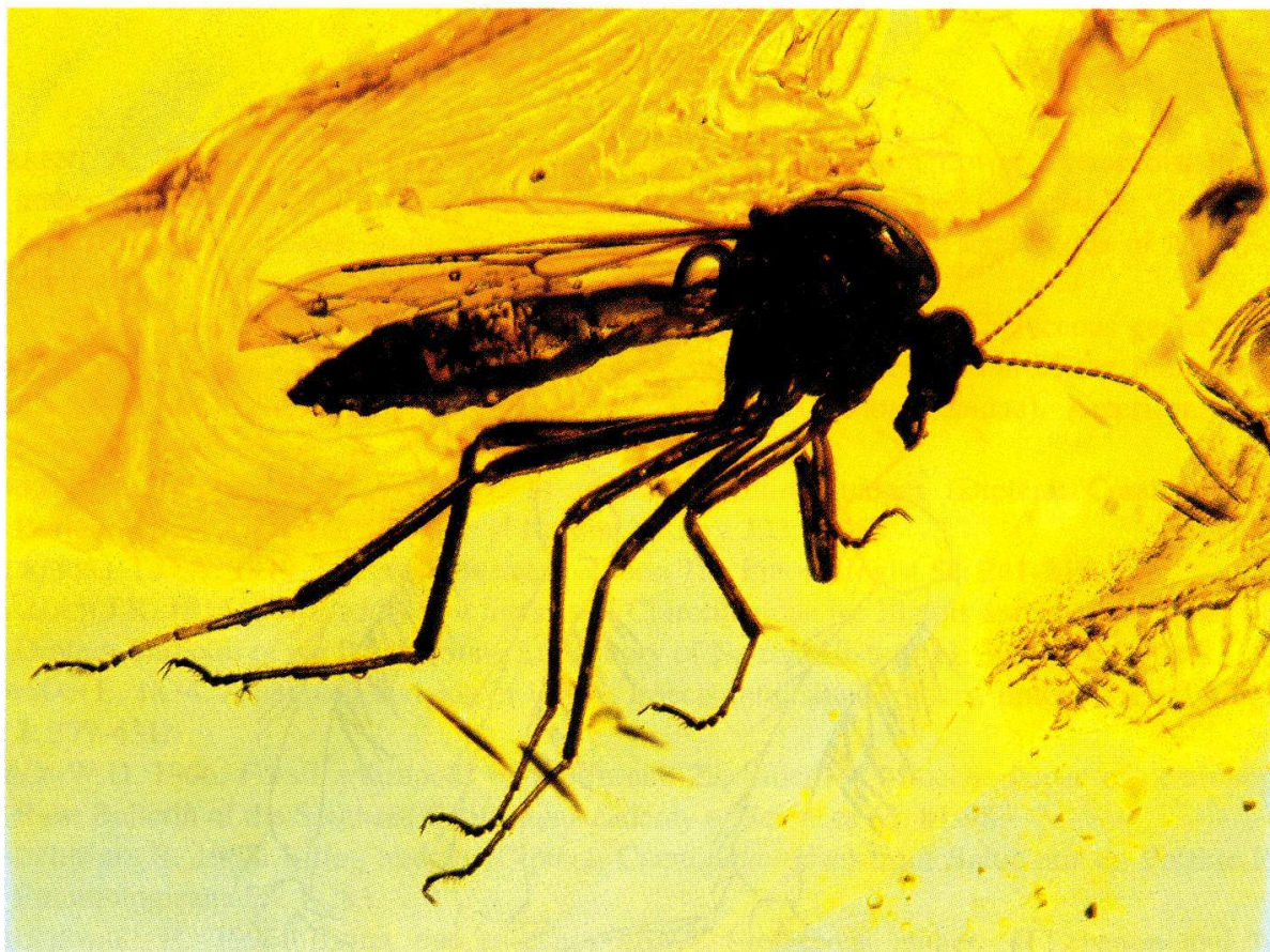
Fig. 1. Mallochohelea martae sp. n., photograph of holotype female.